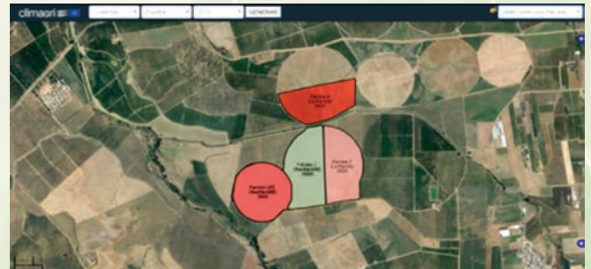
Geographical Information System LIFE + Climagri project.

“ Best agricultural practices for Climate Change: integrating strategies for mitigation and adaptation ”. In the framework of this project, ECAF is coordinating the monitoring of the European Network of Demo Farms. ECAF has also developed a GIS platform through which farmers can calculate the value of the indicators of Climagri for their farms and get recommendations to improve the management of the farm.