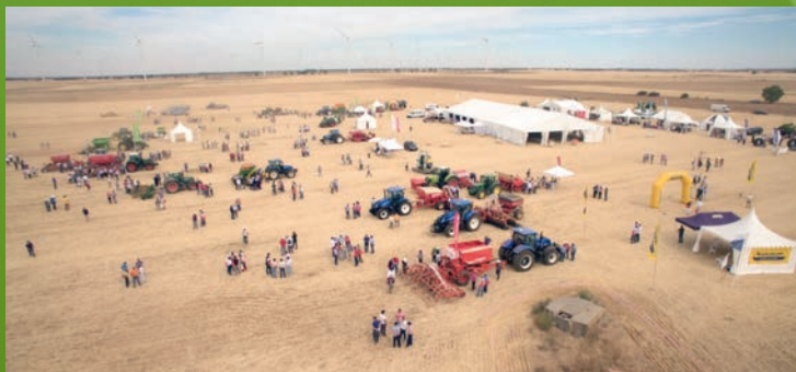
Bird's eye view of the International Field Day of Conservation Agriculture. Barruelo del Valle, Valladolid, (Spain).