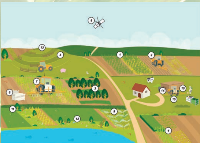
15 INSPIA Best Management Practices.