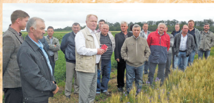
Participants at the seminar for farmers organised in Republic of Moldova (PROCORE).

Long term field experiments on Conservation Agriculture with different crop rotations have been undertaken in Balti, Republic of Moldova jointly with some researches at Selectia Research Institute of Field Crops.