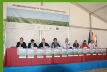
Opening session and view of the attendees at the International Field day on CA. Barruelo del Valle, Valladolid, (Spain).