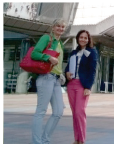
ECAF Vice-president at the European Parliament in Brussels for advocating the Written Declaration on CA.

November 7 th , COP 22. Some members of ECAF jointly with FAO took part in the COP 22 side event named “Climate Change Mitigation and Sustainable Food Security with Conservation Agriculture in Africa and the Mediterranean Region”. Mitigating the impact of Climate Change and Ecosystem Services were the subjects tackled on behalf of ECAF. Likewise, in November 17 th , COP 22. Some other members of ECAF had the chance jointly with the Spanish Association for Conservation Agriculture (AEAC.SV) to exchange insights with the Spanish Minister on Agriculture, Ms García-Tejerina, on the manifold benefits to mitigate climate change CA could offer within the 4 per 1000 initiative in Spain. Agriculture and climate change are closely linked, since agricultural activity can positively or negatively affect global warming.