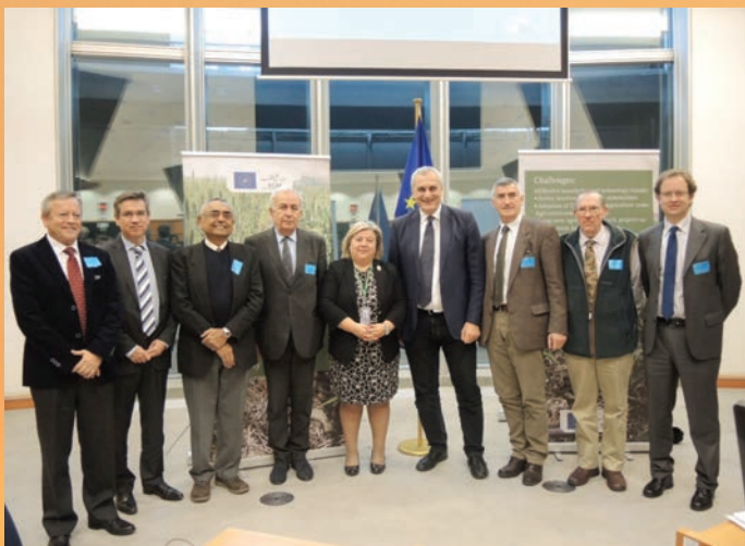
Participants in the seminar “Making sustainable agriculture real” organized in the European Parliament.