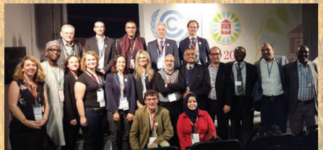
GCAN members attending the COP 22 in Marrakech, November 17 th .

ECAF is a partner of the Global Conservation Agriculture Network (GCAN) recently composed by 17 members including farming organisations, researchers and policymakers from all the world. GCAN aims to provide solutions which help meet the current farming challenge and which ensures that agriculture is more resilient, while still guaranteeing greater food security and sustainability in all climatic conditions.