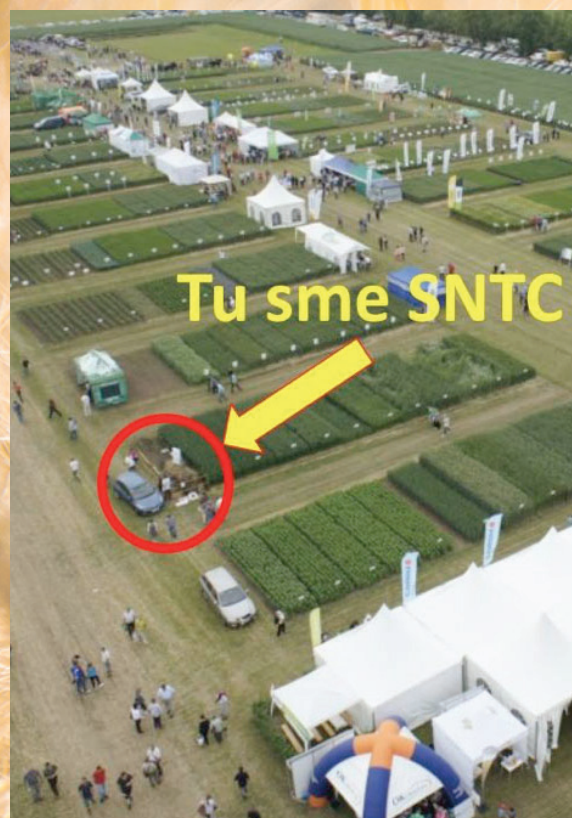
Bird's eye view of the Slovak Field Day, (Slovakia).

SNTC was invited to participate in education activities during the Slovak Field Day on 7 th and 8 th June 2016. It is one of the biggest exhibitions of field of agriculture in Slovakia with many visitors from the country and also from abroad.